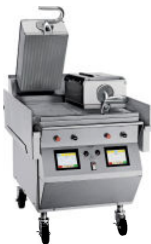
Model G819 Includes grooved upper platen.