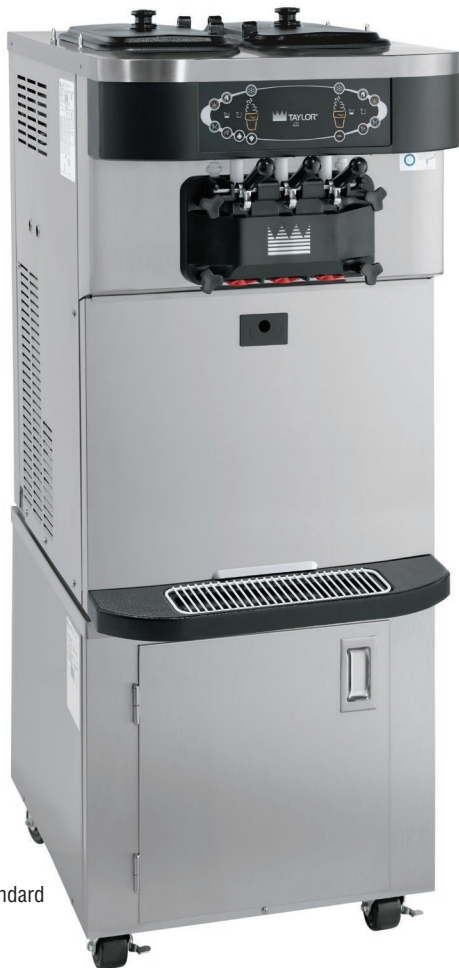
Shown with optional standard height cart.