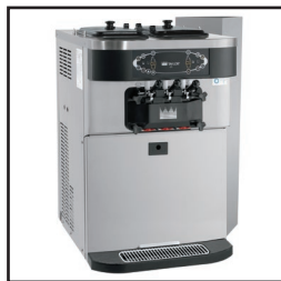
Shown with optional top air discharge chute.