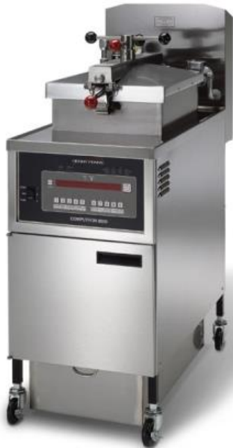
PFG 600 gas pressure fryer with Computron™ 8000 control

Henny Penny first introduced commercial pressure frying to the foodservice industry more than 50 years ago. Frying under pressure enables lower cooking temperatures for longer oil life, and faster cooking times to meet peak demand. Pressure also seals in food's natural juices and reduces the amount of oil absorbed into product.