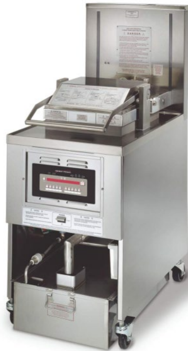
PFE 591 high volume electric pressure fryer

Henny Penny first introduced commercial pressure frying to the foodservice industry more than 50 years ago. Frying under pressure enables lower cooking temperatures for longer oil life and faster cooking times to meet peak demand. Pressure also seals in food's natural juices and reduces the amount of oil absorbed into product.