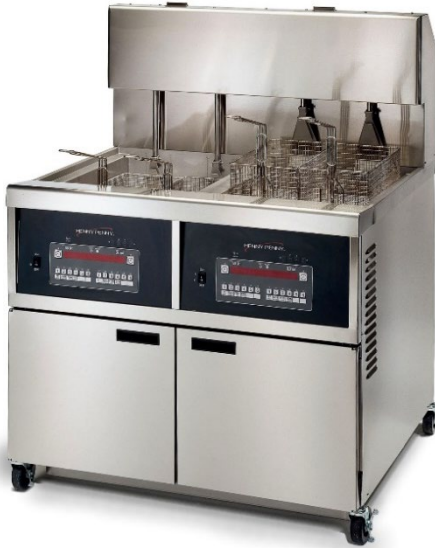
OGA 342 2-well large capacity auto lift gas open fryer

Henny Penny open fryers offer high-volume frying with programmable operation, oil management functions and fast, easy filtration.