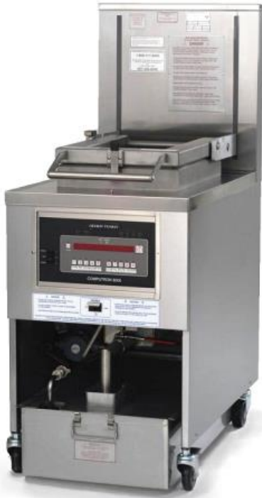
OFE 291 high volume electric open fryer

Henny Penny high volume open fryers offer tremendous throughput in a highly reliable frying platform with programmable operation, oil functions and fast, easy filtration.