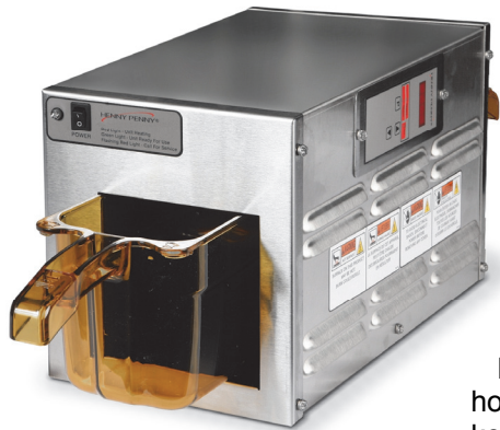
MPC 21L dual access modular multi-purpose holding cabinet

Henny Penny multi-purpose holding cabinets are ideal for keeping small quantities of hot menu items safe, appetizing and ready for immediate serving or packing.