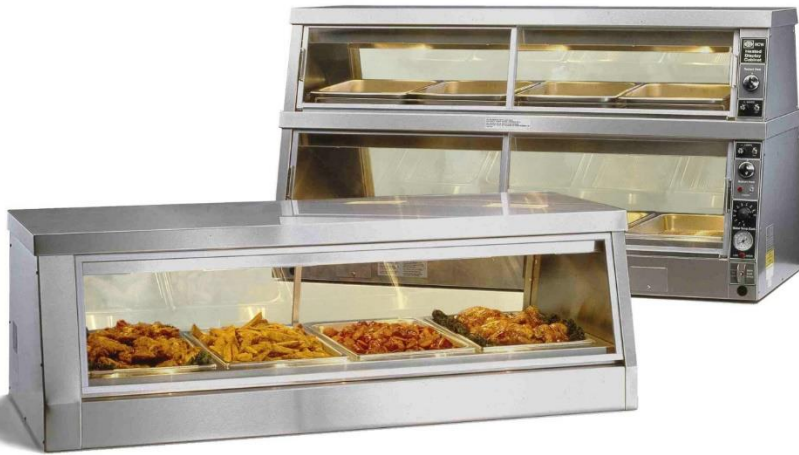
CW 114 single tier and CW 216 two tier display counter warmers

Henny Penny display counter warmers are designed for accumulating, holding and displaying hot fresh food for serving or packing at the point of sale in retail foodservice operations.