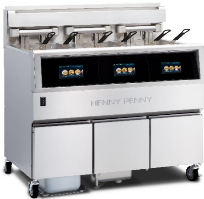
OFE 513 3-well open fryer

The Henny Penny F5 open fryer is designed from the ground up to make frying high-quality food easier, safer and more efficient for any kitchen.