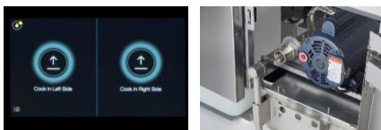
Full color touch and swipe control 8 gpm filter pump

Choose from 1, 2, 3, or 4-well, full or split vat configurations.